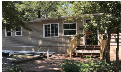
East End Mobile Home Park

CFH provides rental subsidies for income-fragile seniors to allow them to live independently.