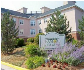
Herndon Harbor House