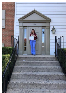
Life Skills Graduate Turned Homebuyer