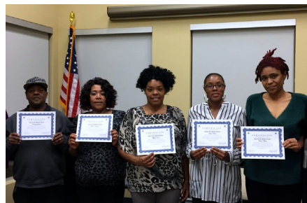
Life Skills Graduates