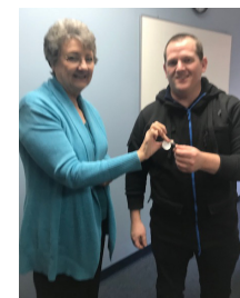
New Homeowner Through NSP Program