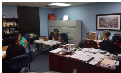
Life Skills Class