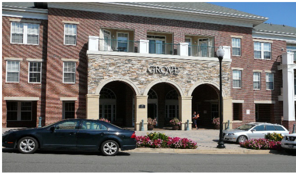
Grove at Arlington

Developer of affordable homes Teacher of educational programs Manager of rental units Creator of housing programs Administrator of housing programs Part of the solution as an active member of the Northern Virginia housing community