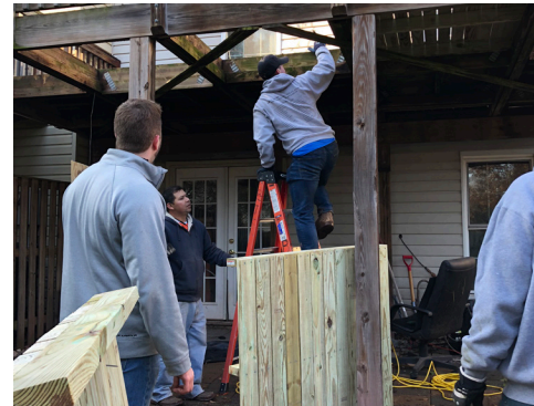
Volunteers from Whiting Turner install new deck panels.