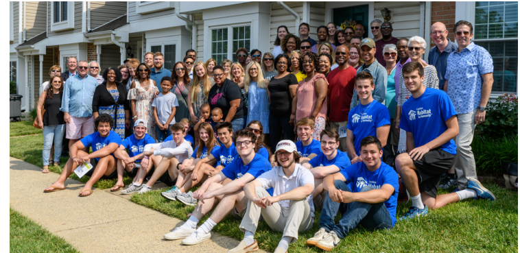
This picture captures the many members of our community that worked on our 50th home in Sterling, VA.