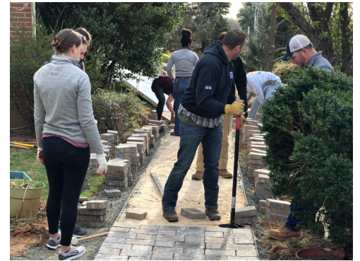
Photos left - celebrating the completion of this project. Photo right top - the new walkway and wheelchair ramp. Photo bottom - hard working volunteers from Holder Construction on the job.

"It was a pleasure to help a neighbor in need."