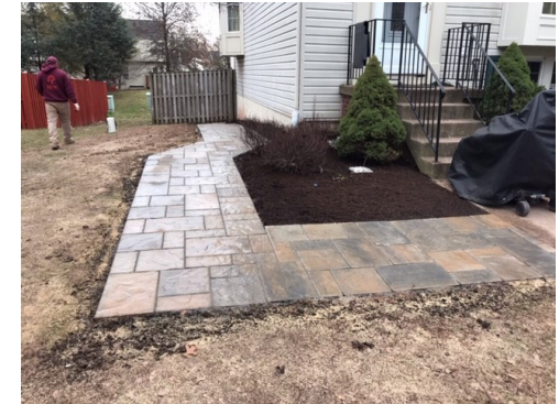
A new walkway will make the wheelchair lift accessible from the front of the house.