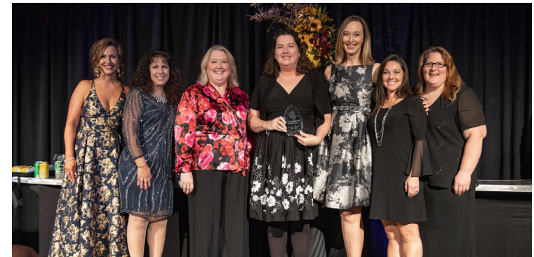
Loudoun Habitat for Humanity was the proud recipient of the Loudoun County Chamber of Commerce Small Business Award for Nonprofit Organization of the Year.