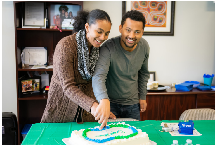
The happy couple celebrate the completion of their Home Buyer Club training.