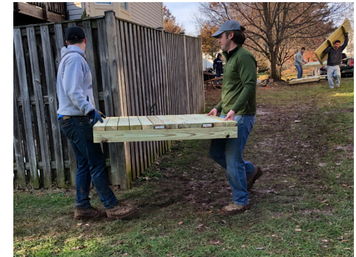
Many hands make light work.