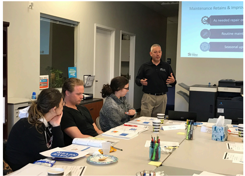
Future homeowners learning the importance of regular home maintenance.