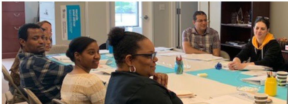
Future homeowners working together during a session of the Home Buyers Club.