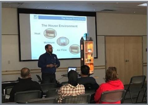
A Tools for Life workshop on Home Weatherization.