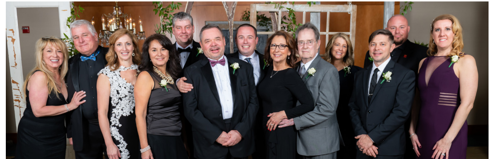
Loudoun Habitat Board Members enjoying the Raise the Roof Gala.