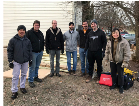
A volunteer team braving the cold to help build.